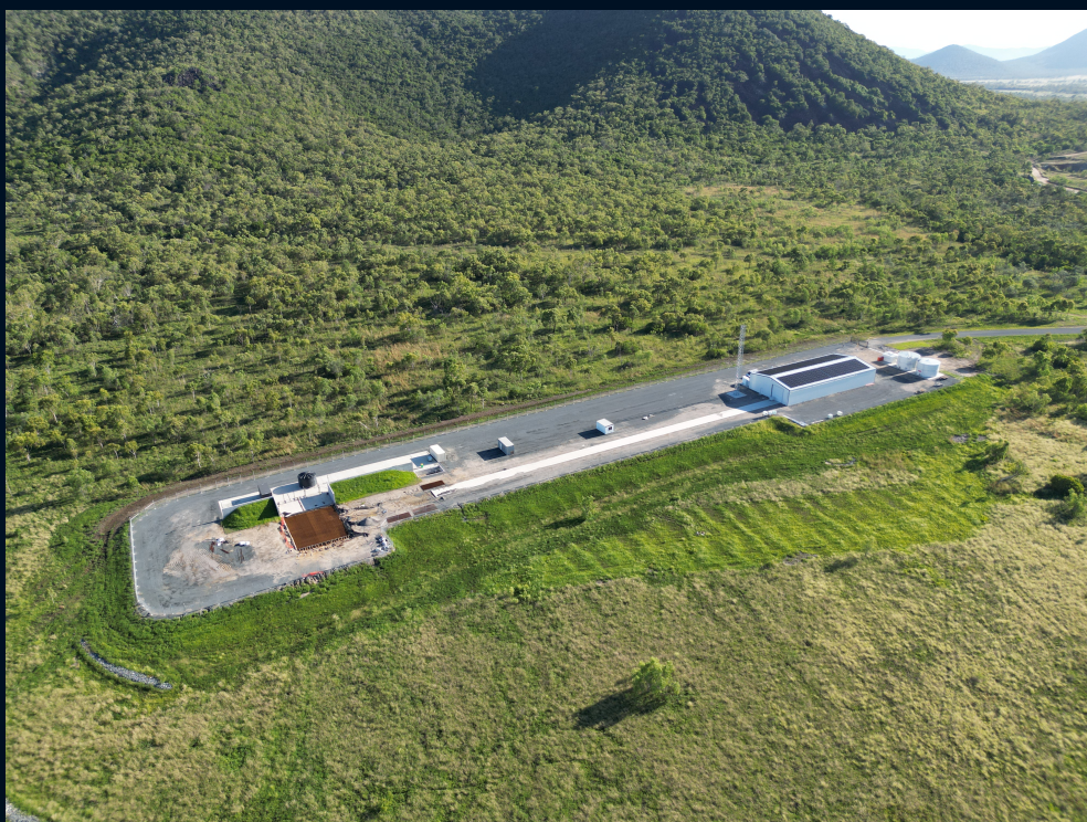
An aerial shot of Bowen Spaceport.