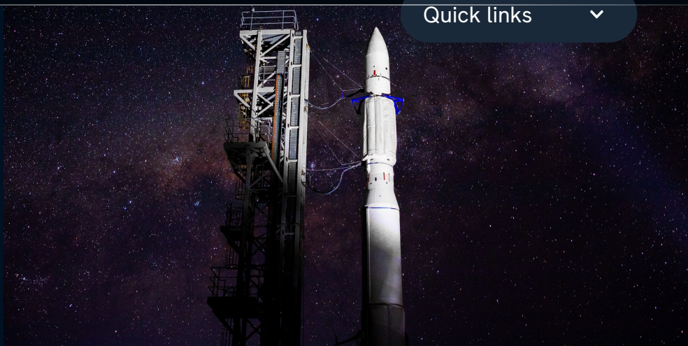
The Eris rocket.