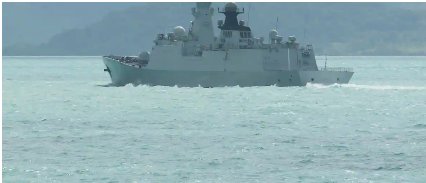
People's Liberation Army-Navy frigate Hengyang.

It comes after a Chinese flotilla circumnavigated Australia and conducted live firing exercises off the coast in February.